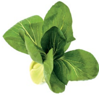
Shanghai Bok choy