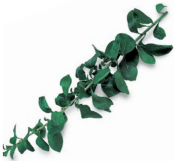
Chinese box thorn