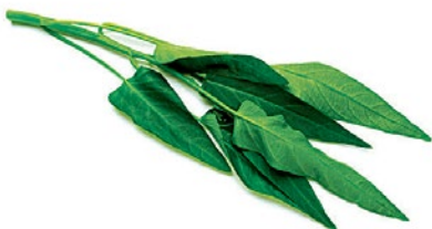
Ong choi [Water spinach]