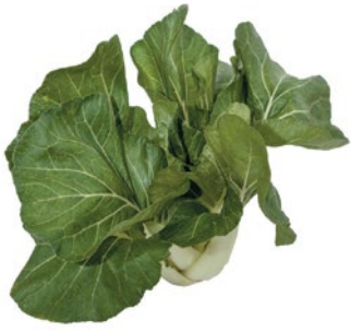
Bok Choy [Pak choy/choi]