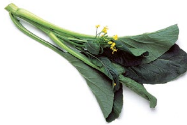
Choy sum [choi sum]